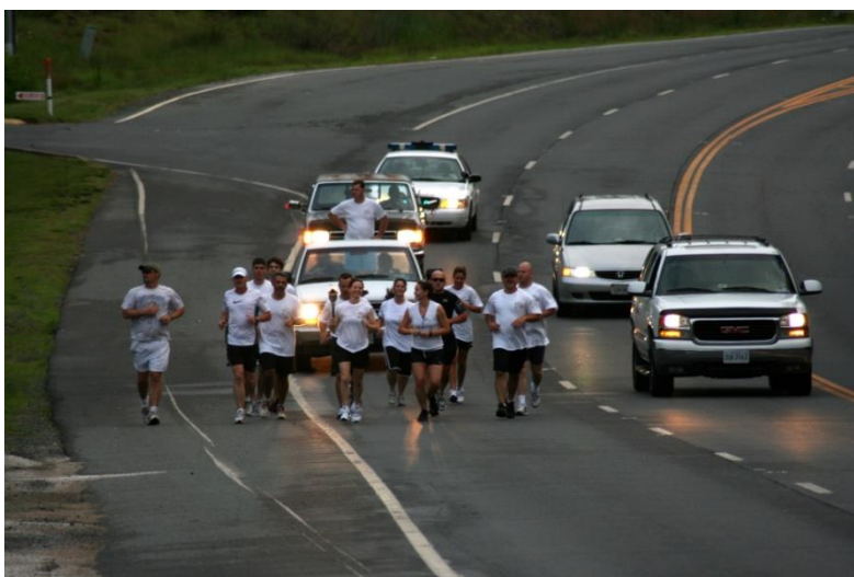
Henrico (Route 60)